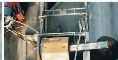
ComTec system in the ready-mix concrete plant