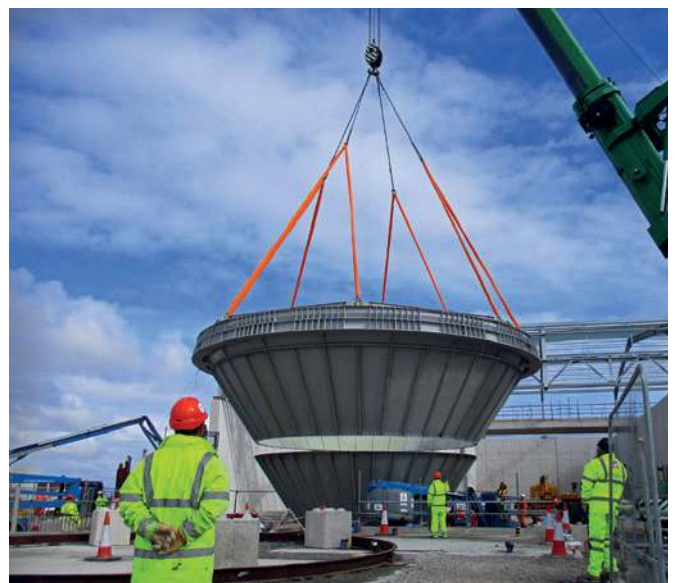
Construction of the base cone for the ground granulated blast furnace slag (GGBS) silo (April 2017).

This essential equipment plays a key role in keeping the mix quality at nuclear standard.