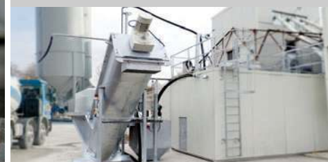
RWS compact system

Recycling systems for precast and read-mix concrete plants – Cost-efficient. Durable. Modular.