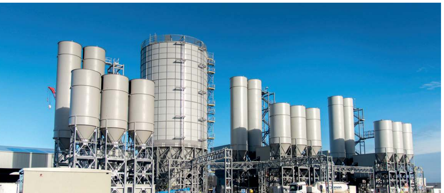
View of Bylor's three concrete batching plants, including a GGBS Silo at Hinkley Point C (December 2017).

When plans to build Hinkley Point C nuclear power station were first put on the drawing board, we were contacted at an early stage by industry-leading concrete batching plant manufacturers D and C Engineers and asked to assist in helping to design mixing and batching equipment that could cope with the demands and challenges of a project of this size.