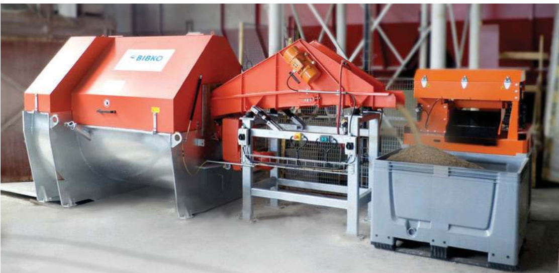
ComTec 4 in the precast plant